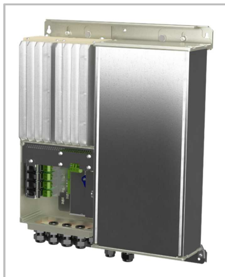
SYSTEM WITHOUT COVER AND OPEN SYSTEM BOX