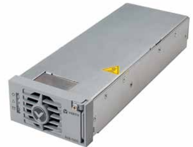
R48-1000, NetSure 211 Rectifier

As the temperature increases from 45 °C to 75 °C, the thermal power limit circuit linearly decreases power. In the typical operating range, these rectifiers have a total harmonic distortion less than 5%, and efficiencies greater than 92% (1000 W). Each hot-swappable rectifier has an integral multi-speed cooling fan and tri-LED status indication.