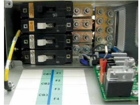
Internal Distribution Configuration

An enclosed battery cabinet is available that can be mounted on the wall or in a relay rack. A 40 A battery disconnect is included with the battery cabinet. It can be connected in parallel with other cabinets to provide additional backup time.